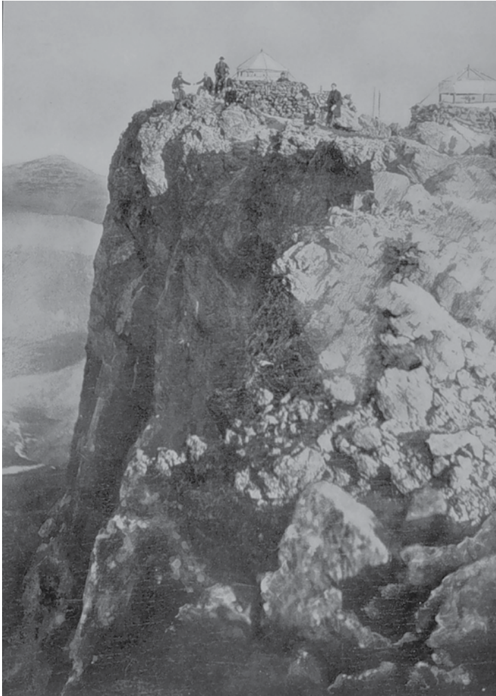
View of Summit Station on Uncompahgre Peak, Colorado. (Altitude: 14,289 ft). The observing tent further back on the right was used for astronomic observations.

the first of November, excepting, however, the period of thunderstorms in midsummer. These thunderstorms, on account of their persistency among the high mountains, have frequently given rise to much suffering, danger, and delay in the progress of the work.