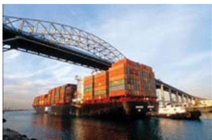
PORTS® data provide under keel and above-ship clearance