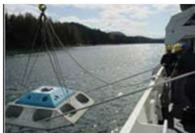
Deployment of an ADCP current meter

Based on an assessment of the tidal current program in 1999, program activities began focus-