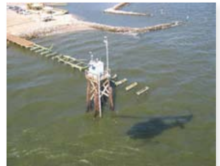
The hardened NWLON station at Dauphin Island survives Hurricane Katrina

Data collection through GOES satellite transmission and 24X7 quality control operations has led to virtually real-time application of data at all NWLON stations. These stations are active components of NOAA's Tsunami Warning System and Storm Surge Warning networks. Their modern data collection platforms can collect other meteorological and oceanographic data as well. A NWLON gap analysis estimates 300 stations would be needed, including at the Great Lakes and U.S. Ocean Island Territories and Possessions, to achieve an optimum size. Currently there are 200 NWLON stations operating.