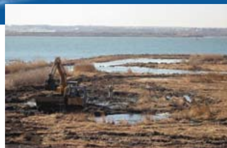
Using proper tidal datum elevation control to reconstruct a marsh surface

In order to meet the needs of a broader suite of customers, CO-OPS recently formed the Coastal Oceanographic Applications and Services of Tides And Lakes (COASTAL) Program to focus on non-navigational and non-traditional applications of water levels and datums, such as wetlands restoration, coastal zone management, long-term sea-level assessments, storm-surge monitoring, and emergency preparedness.