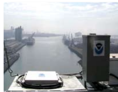
New air gap sensor technology installed into operations on a bridge in Long Beach, California, after OSTEP test and evaluation

The COASTAL Program operates through partnerships internally with NOAA and externally with other federal agencies, state and local governments, and nonprofit organizations. The COASTAL Program has expanded to include similar non-traditional applications of geodetic datums within NOAA/NOS National Geodetic Survey.