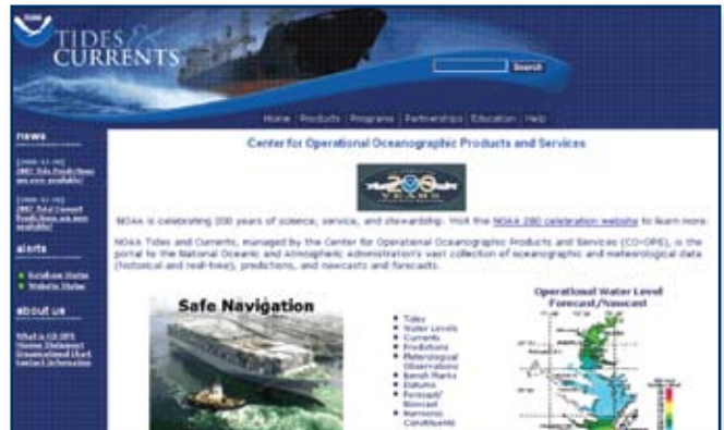
The CO-OPS home page [ http://tidesandcurrents.noaa.gov/ ]

exponentially. Using the strengths of a fundamental program serving the maritime transportation sector needs for tide, water level and current observations and predictions, the tides and currents legacy program has transitioned to a modern operational oceanographic organization that meets a broad spectrum