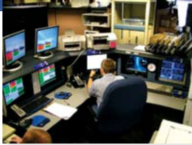
CORMS 24 x 7 operations

CO-OPS. The primary mission of CORMS is to perform thorough and robust QA/QC on all real-time data, systems, and products in the CO-OPS domain. CORMS not only ensures that real-time data are readily available, but stops dissemination of questionable data. All data and products are monitored and reviewed on a 24 x 7 basis, automatically and by experienced CORMS operators working 12-hour shifts. CORMS also utilizes a rules-based artificial intelligence system. When a system and/or data problem is detected, CORMS stops dissemination of data, remedies the situation, or forwards the information to the appropriate field technicians and/or IT personnel to enable corrective action.