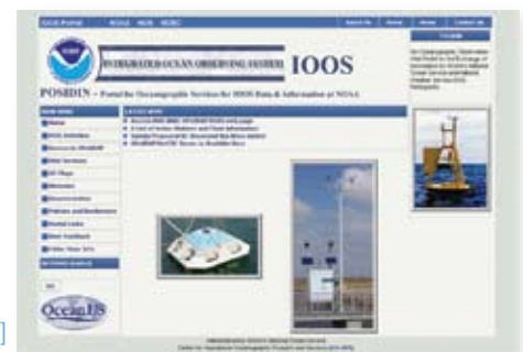
The IOOS data portal [ http://tidesandcurrents.noaa.gov/ ]

of user needs. The core values of the program and the dedication of the people have not changed. From real-time delivery of data and products, to improved prediction and forecast tools, to improved long-term sea level assessments, CO-OPS has integrated new technology in data collection, quality control, processing, and delivery. The vision is to continue to grow partnerships with users and with other state and federal agencies to maintain the utility and relevance of our products and services. All the products and programs mentioned here will be featured in subsequent issues of the ACSM Bulletin . Interested readers can visit the NOAA web-site: http://tidesandcurrents.noaa.gov and look under Products, Programs, and Partnerships for more information. Also, check out NOAA's 200th anniversary web site: http://celebrating200years.noaa.gov/welcome.html .