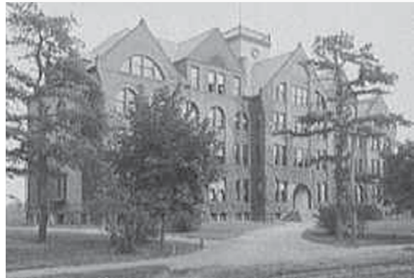
The home of basketball—Y.M.C.A. training school in Springfield, Mass.

Also, Naismith's early rules did not allow for dribbling the basketball. Players simply passed the ball and then shot it at the basket. Dribbling to move the ball around the court came into the sport about 10 years after Naismith had written his original rules.