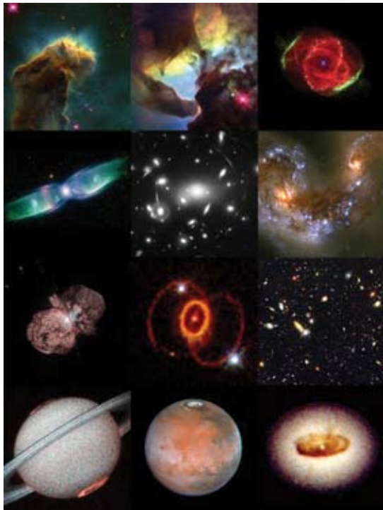
Some of the most amazing discoveries about our universe have been made with the help of the Hubble space telescope. Cancelled after the Columbia disaster, the rescue of the ageing telescope is still a toss-up.

in 2005 with President Bush's imprimatur. That plan calls for a return of astronauts to the moon and the establishment of a permanent base there as a staging ground for missions that might someday include putting humans on Mars.