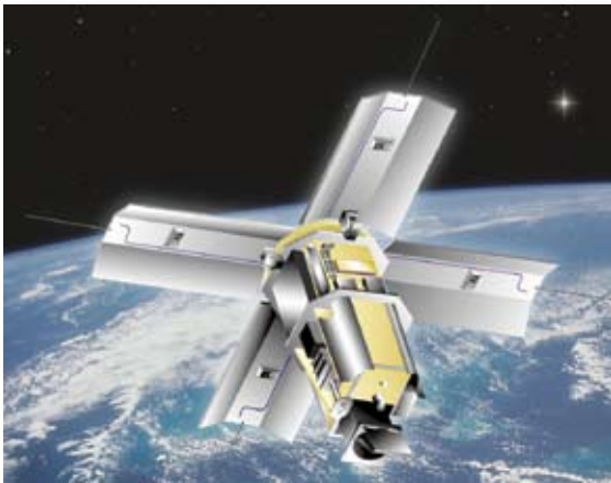
Civilian applications of IRS technology include nonproliferation, detection of nuclear explosions, lightning science, climatology, broad-area mapping of land use, and environmental monitoring. The MTI sensor shown here enables accurate quantitative analysis of thermal processes on the Earth's surface.

Four years ago, there was no such video capability and limited top secret communications channels. Couriers were often used to synchronize intelligence databases at unit command posts.