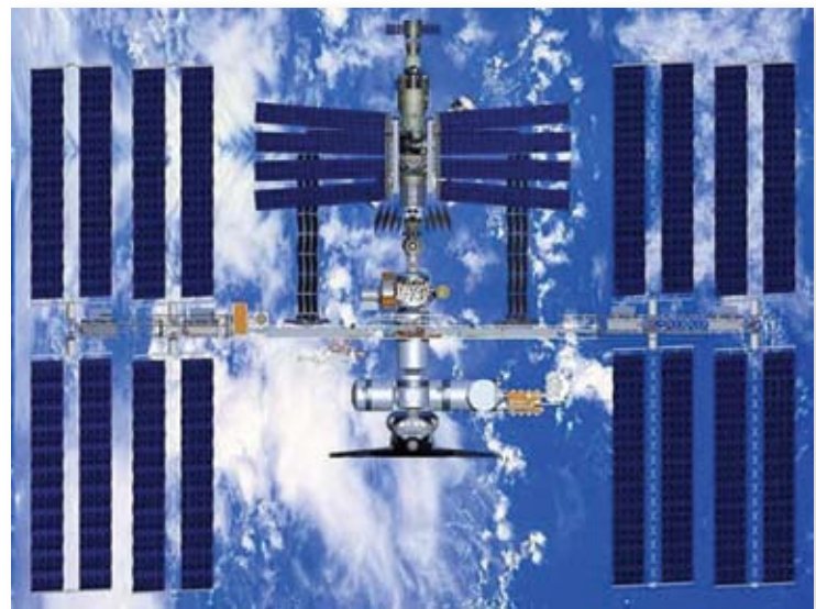
The International Space Station.

NASA is in the process of finishing the international space station, retiring the space shuttle and building a new architecture for putting humans in space, with the Constellation program. The agency is following a road map called the "Vision For Space Exploration," adopted