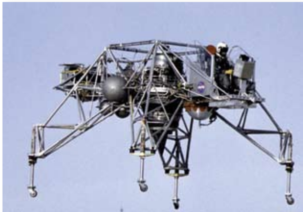
The first LLRV in flight, 1967. Precursor of Apollo lunar landers.

Blasting off into space to find water on, say, Europa when some on terra firma don't even have access to clean drinking water may seem frivolous. Except that becoming a space-faring civilization—which we have focused on since October 1, 1958, when the National Aeronautics and Space Administration was established by President Eisenhower—is not a frivolous undertaking. It's forward thinking, it's pushing the bar of knowledge and future options—it's being a superpower.