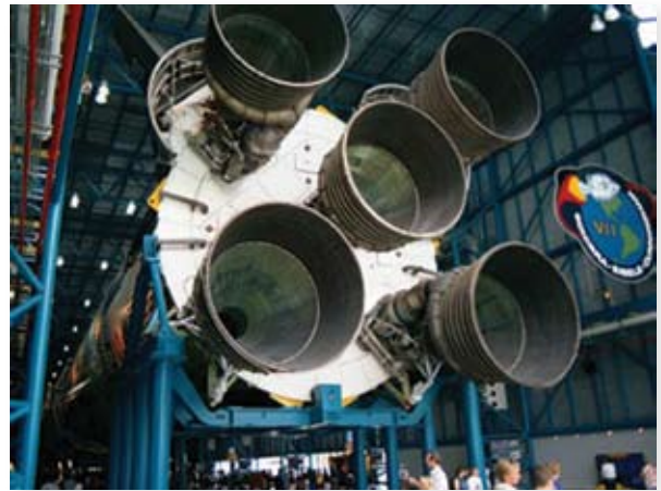
Saturn v rocket engines that took NASA to the Moon.